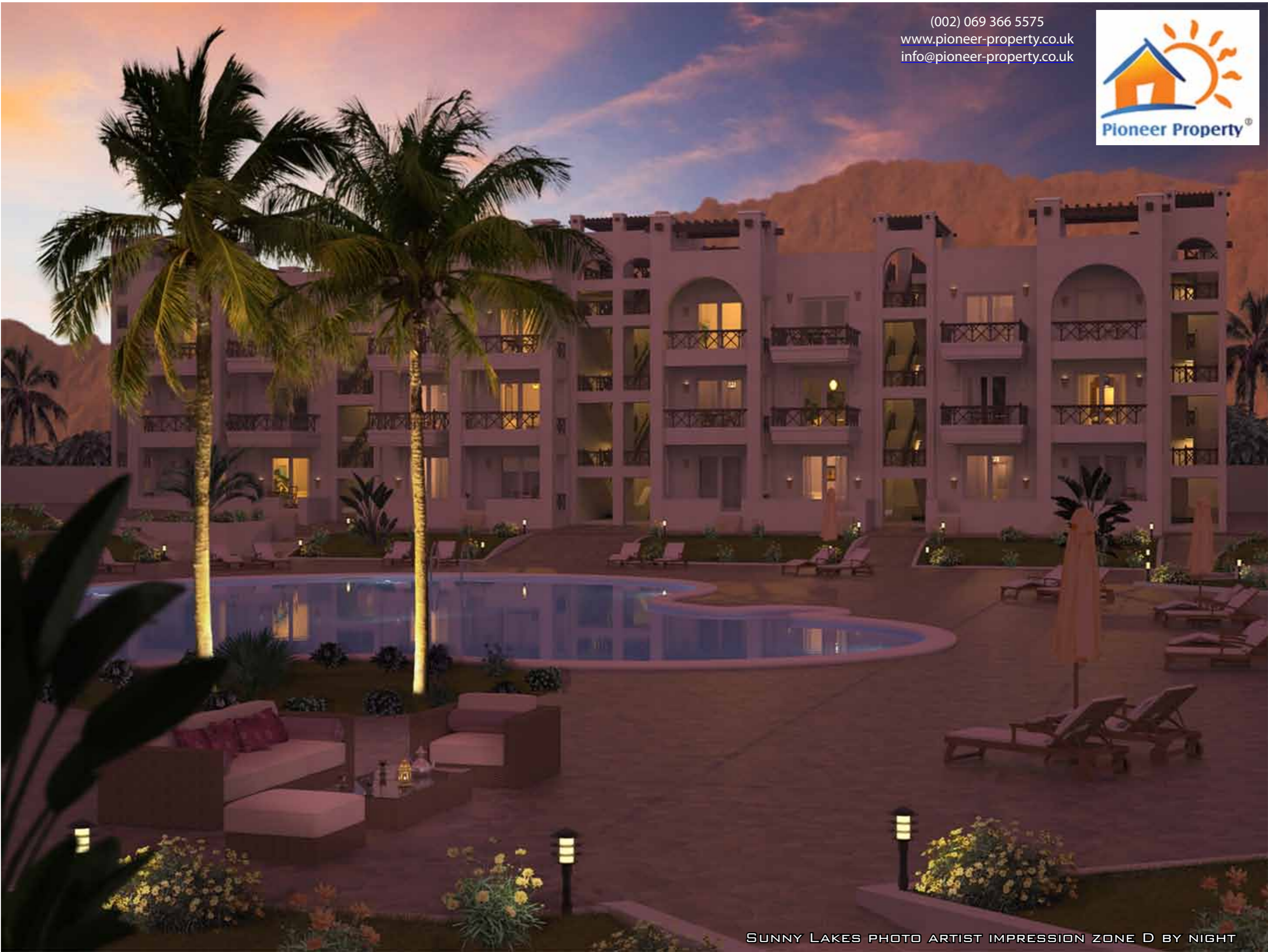
SUNNY LAKES PHOTO ARTIST IMPRESSION ZONE D BY NIGHT