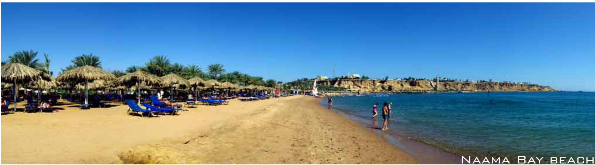
NAAMA BAY BEACH