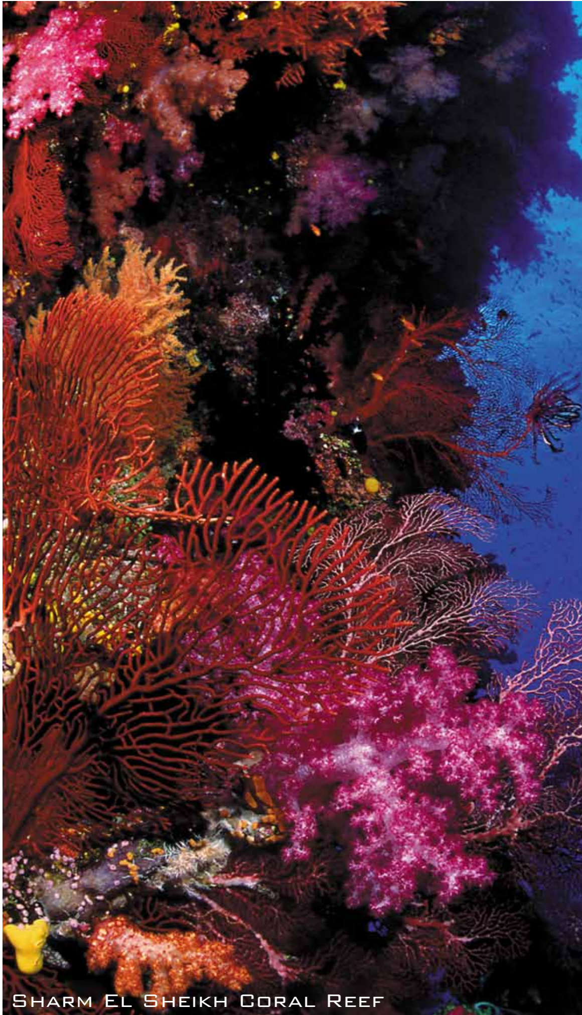
SHARM EL SHEIKH CORAL REEF