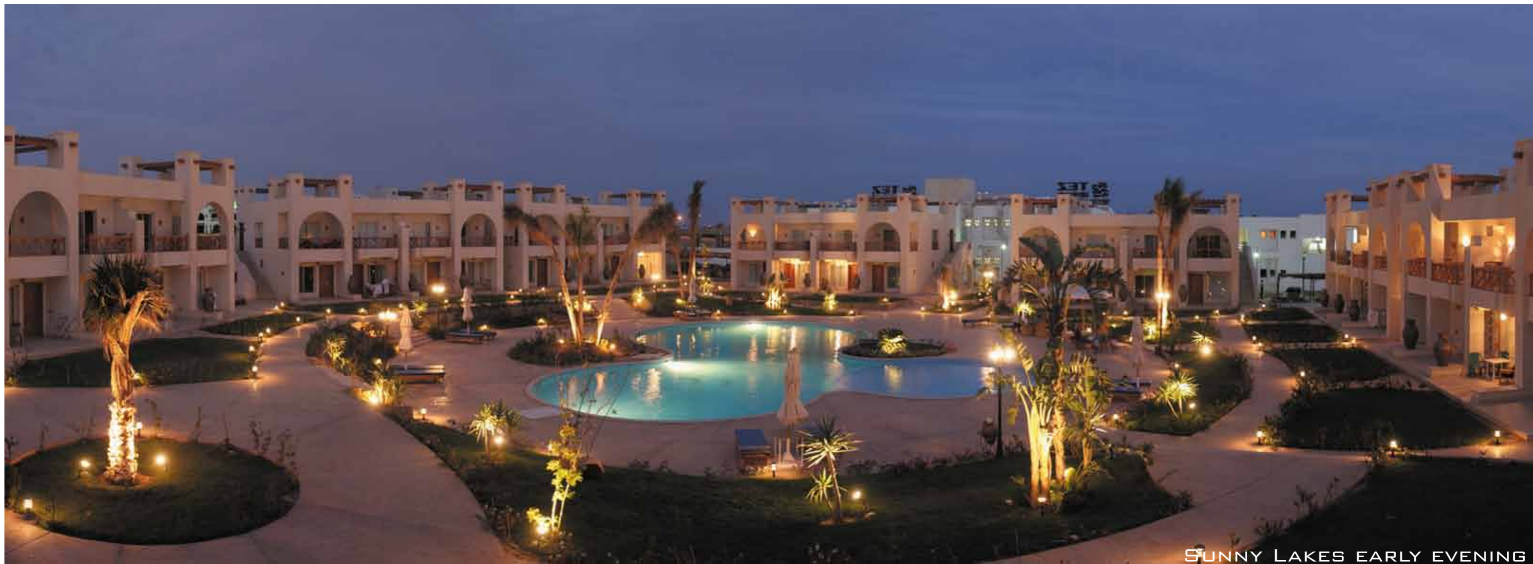
SUNNY LAKES EARLY EVENING