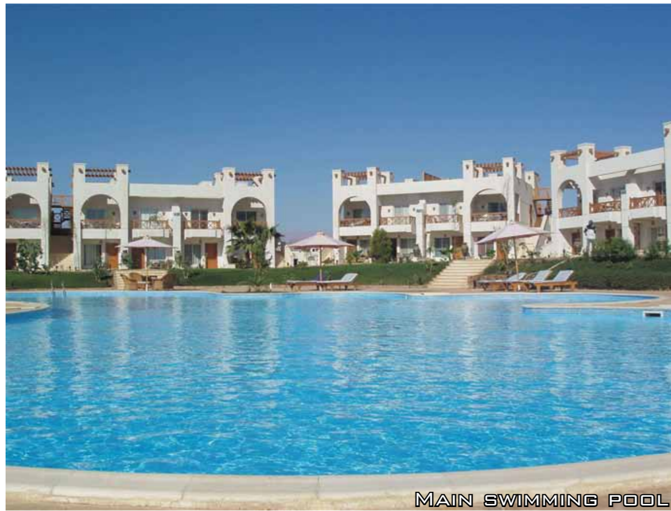
MAIN SWIMMING POOL