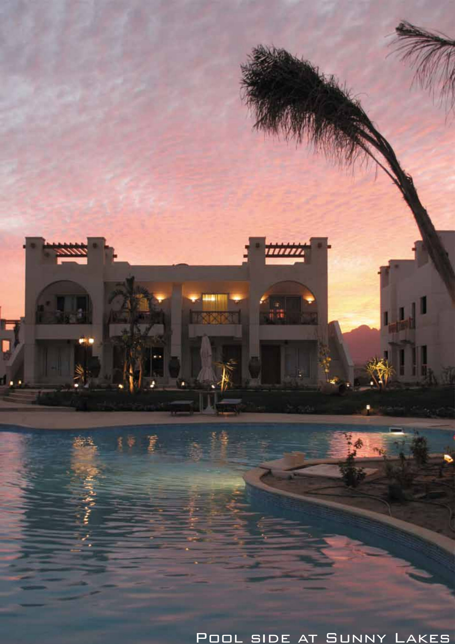
POOL SIDE AT SUNNY LAKES