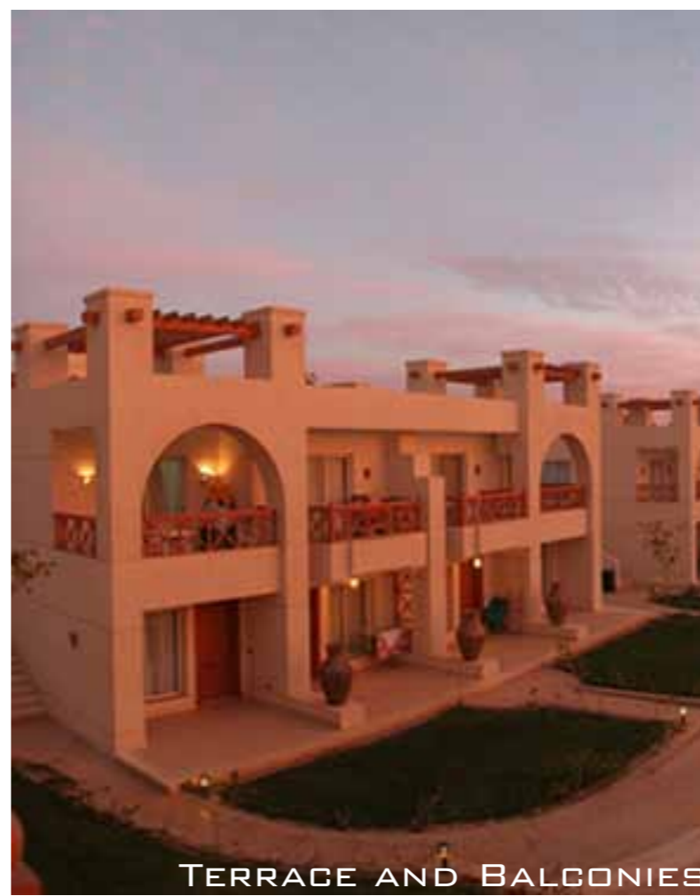
TERRACE AND BALCONIES