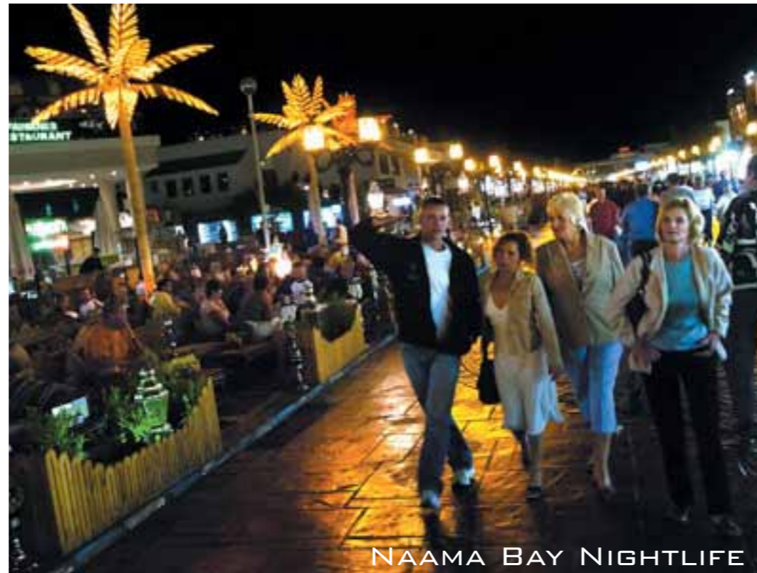
NAAMA BAY NIGHTLIFE