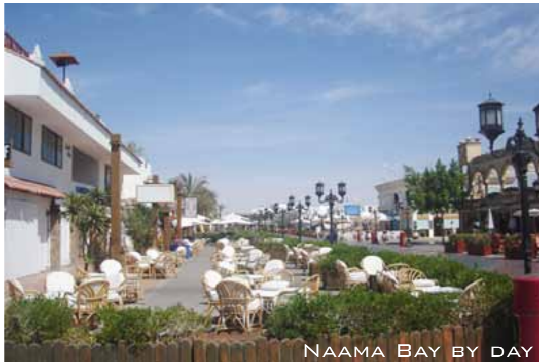
NAAMA BAY BY DAY