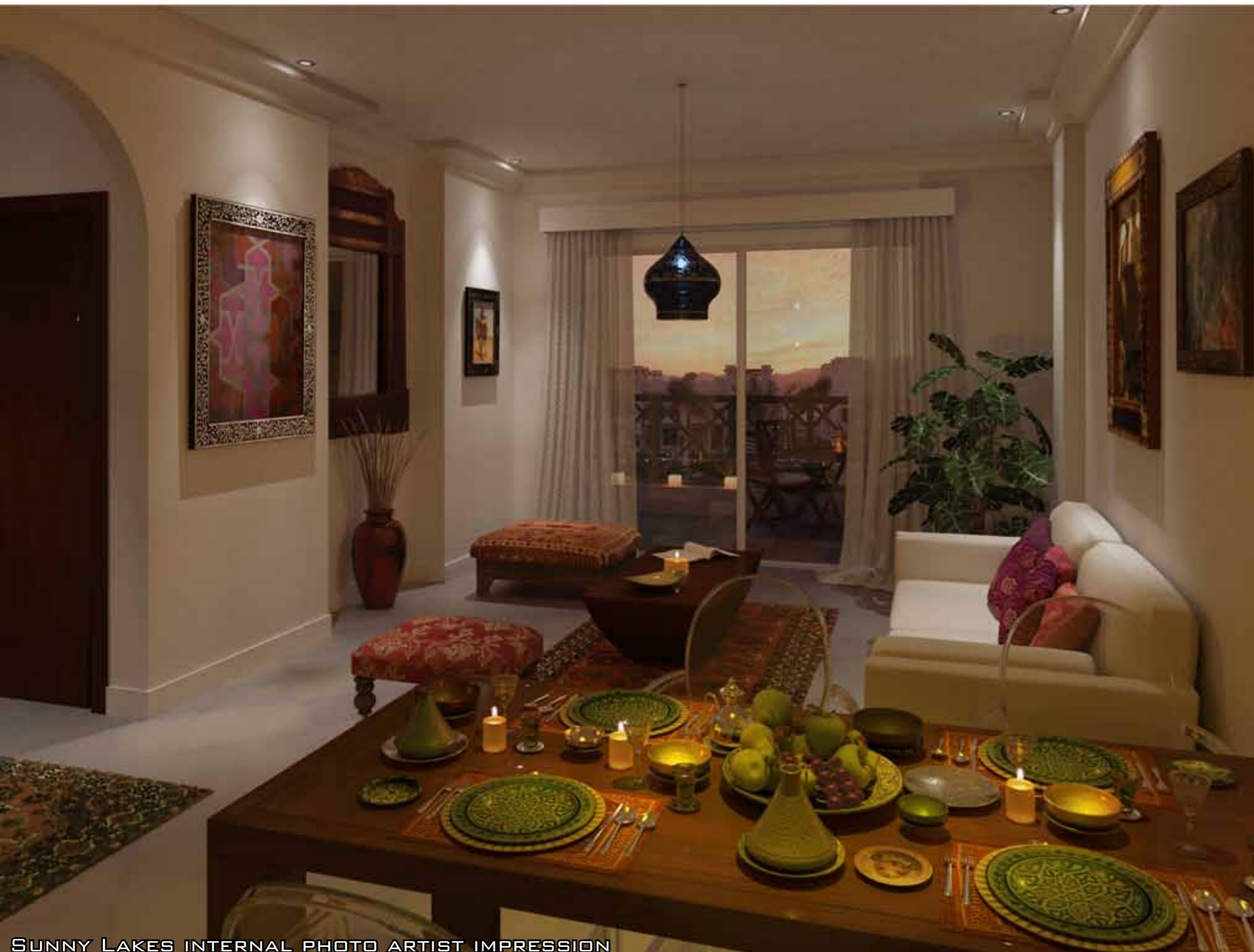
SUNNY LAKES INTERNAL PHOTO ARTIST IMPRESSION

SUNNY LAKES APARTMENTS ARE BEING FURNISHED BY QDS FURNITURE, EACH APARTMENT CAN EITHER HAVE A BESPOKE TAILORED MADE DESIGN OR A READY MADE FURNITURE PACK.