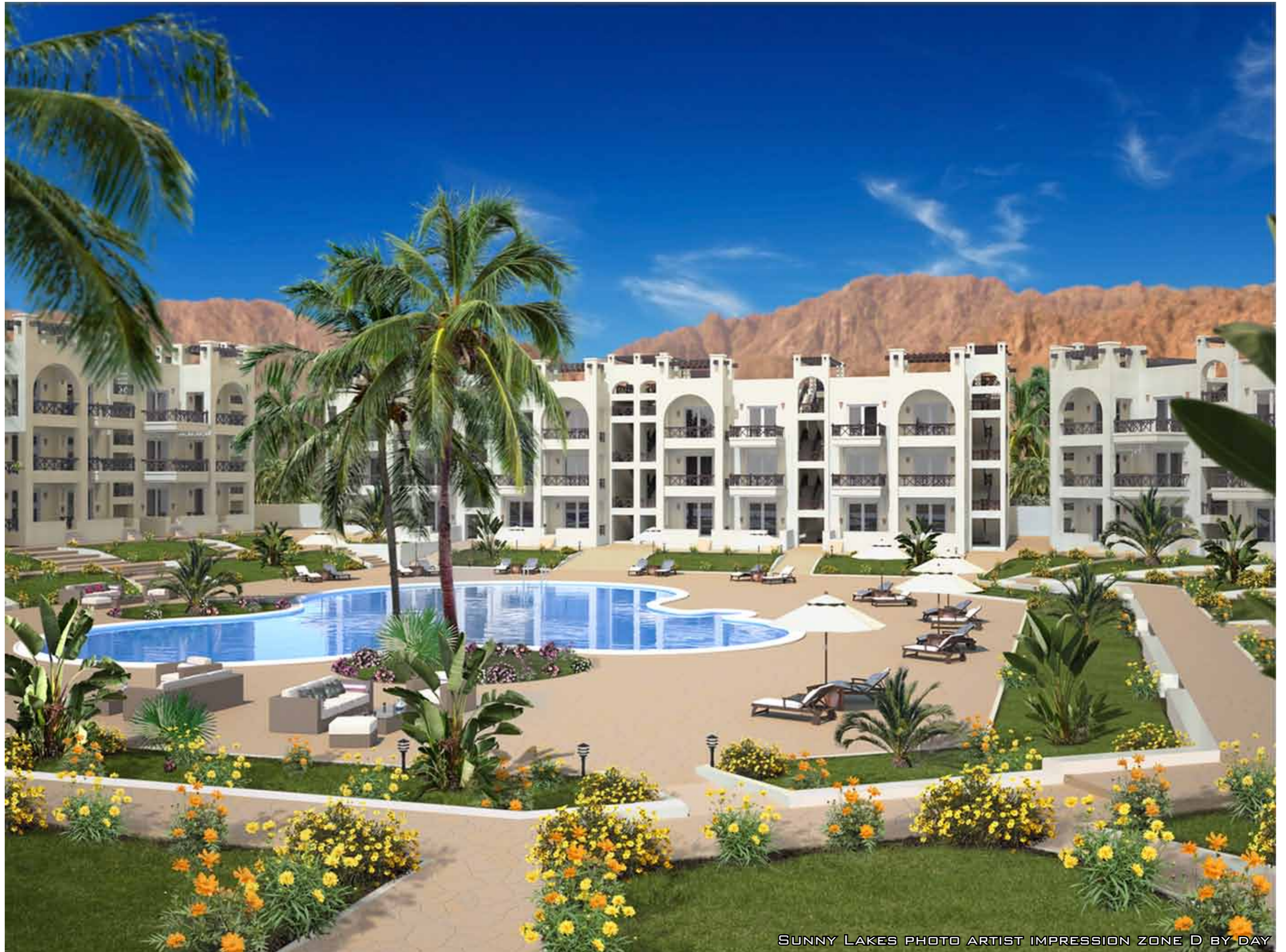
SUNNY LAKES PHOTO ARTIST IMPRESSION ZONE D BY DAY